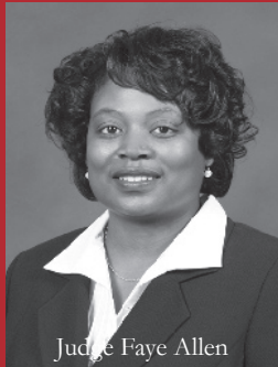
Judge Faye Allen