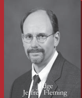
Judge Jeffrey Fleming